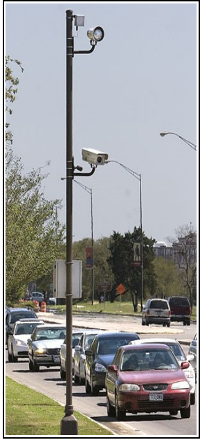
Typical camera system.